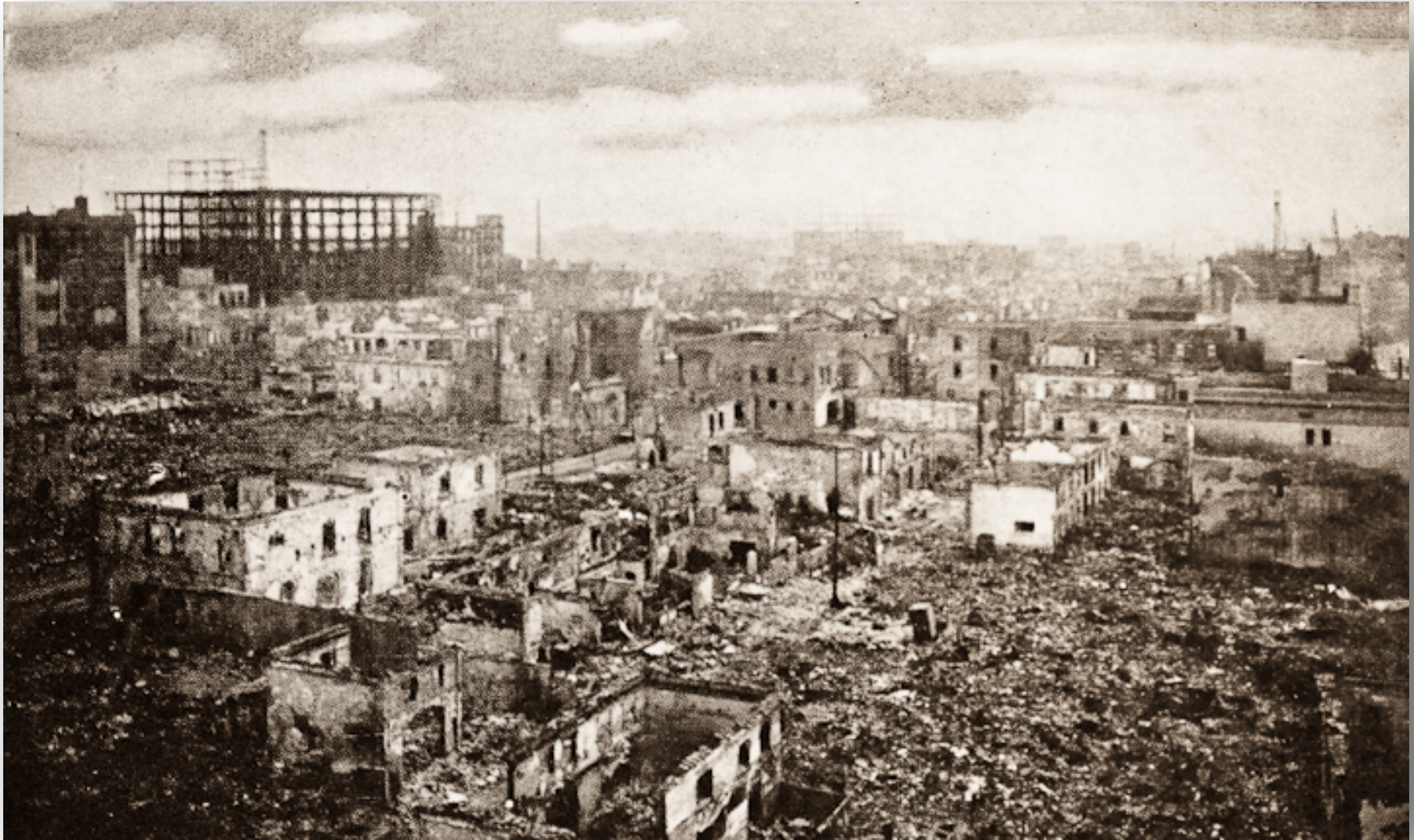
The Great Kantō Earthquake, 1923