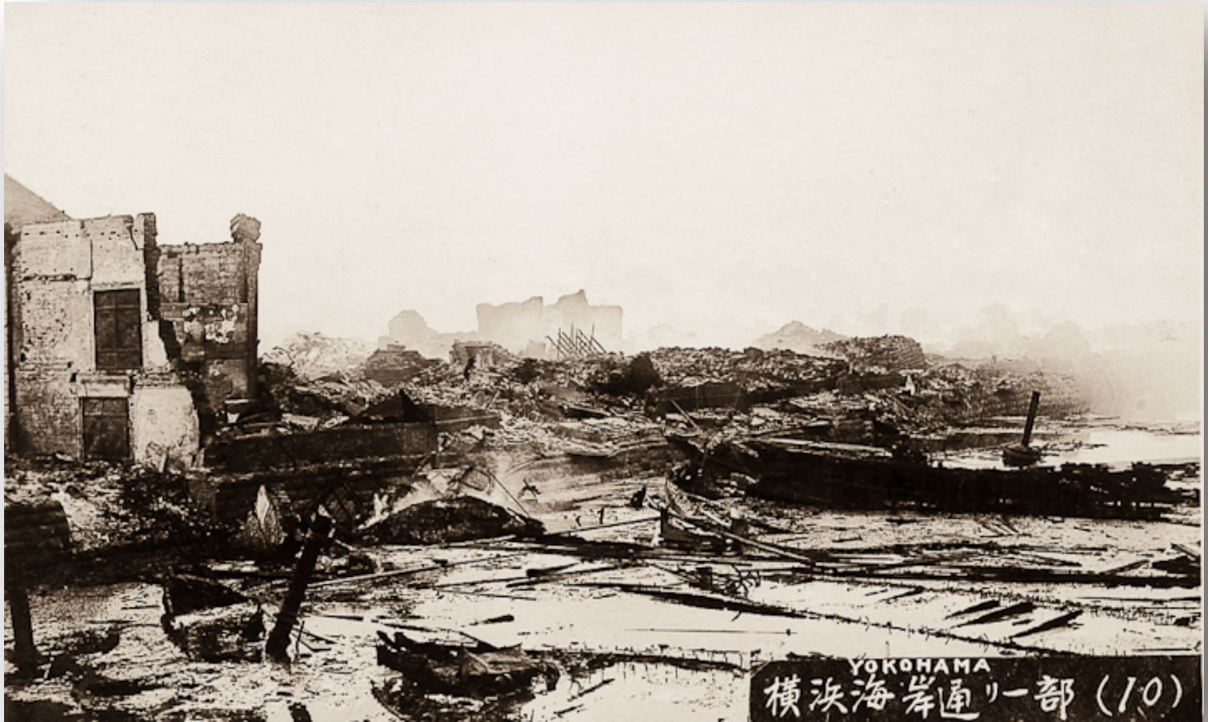
The Great Kanto Earthquake, 1923