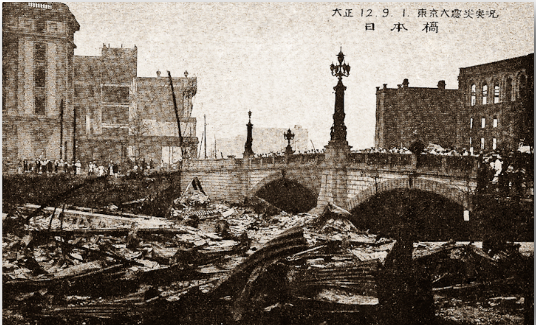
The Great Kantō Earthquake, 1923