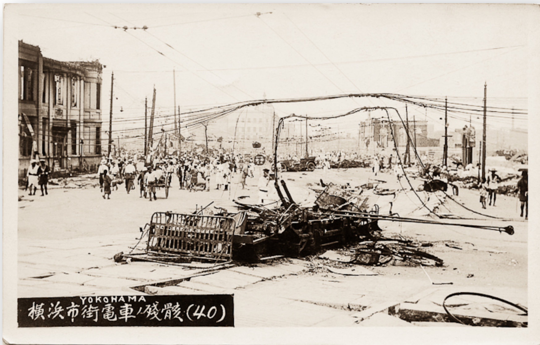
The Great Kanto Earthquake, 1923