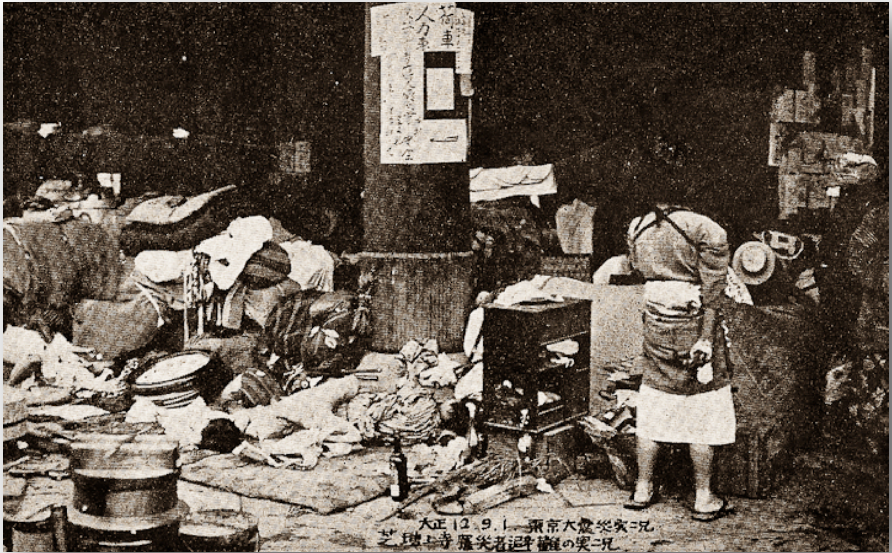
The Great Kanto Earthquake, 1923