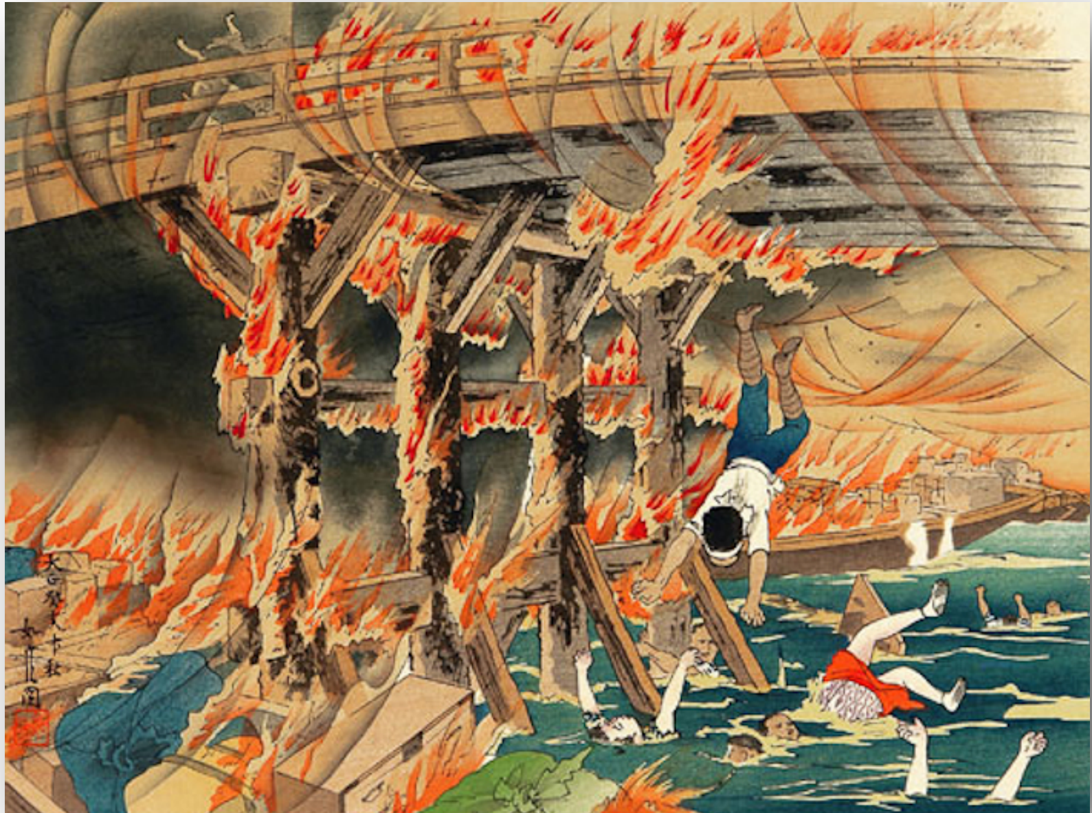
The Great Kanto Earthquake, 1923