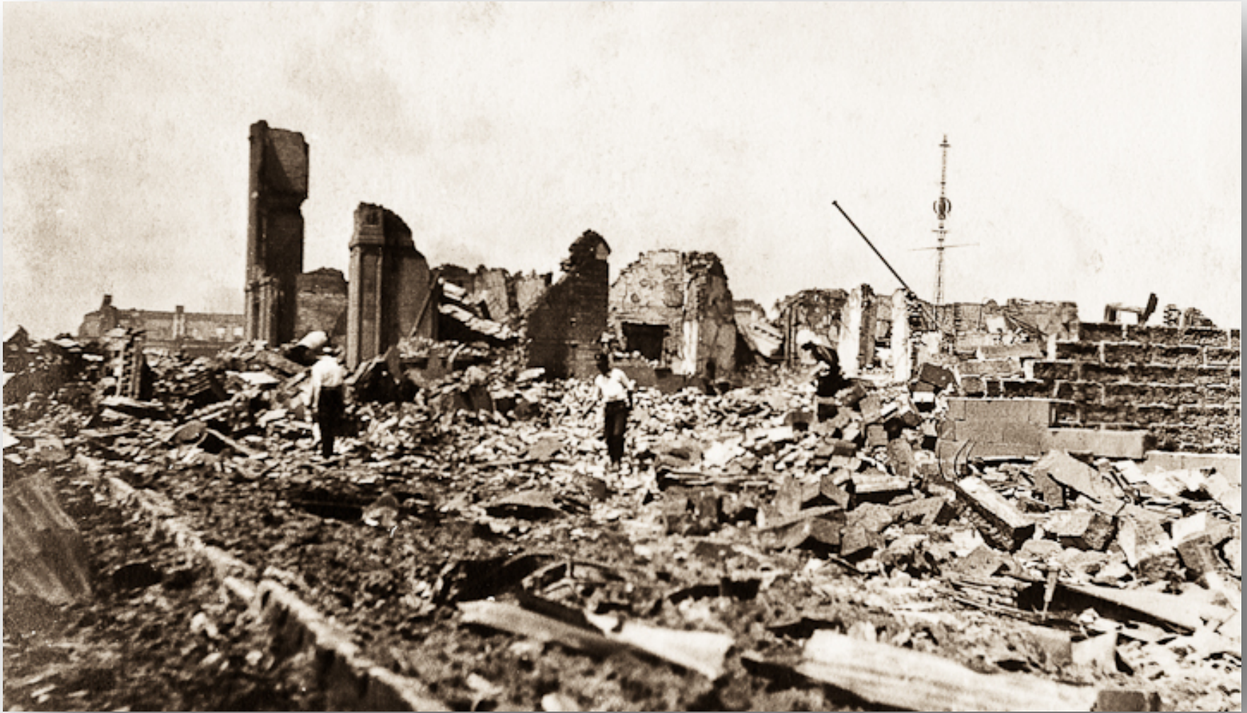
The Great Kantō Earthquake, 1923