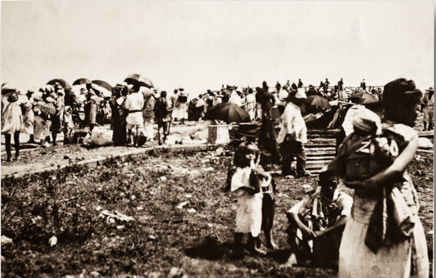
The Great Kantō Earthquake, 1923