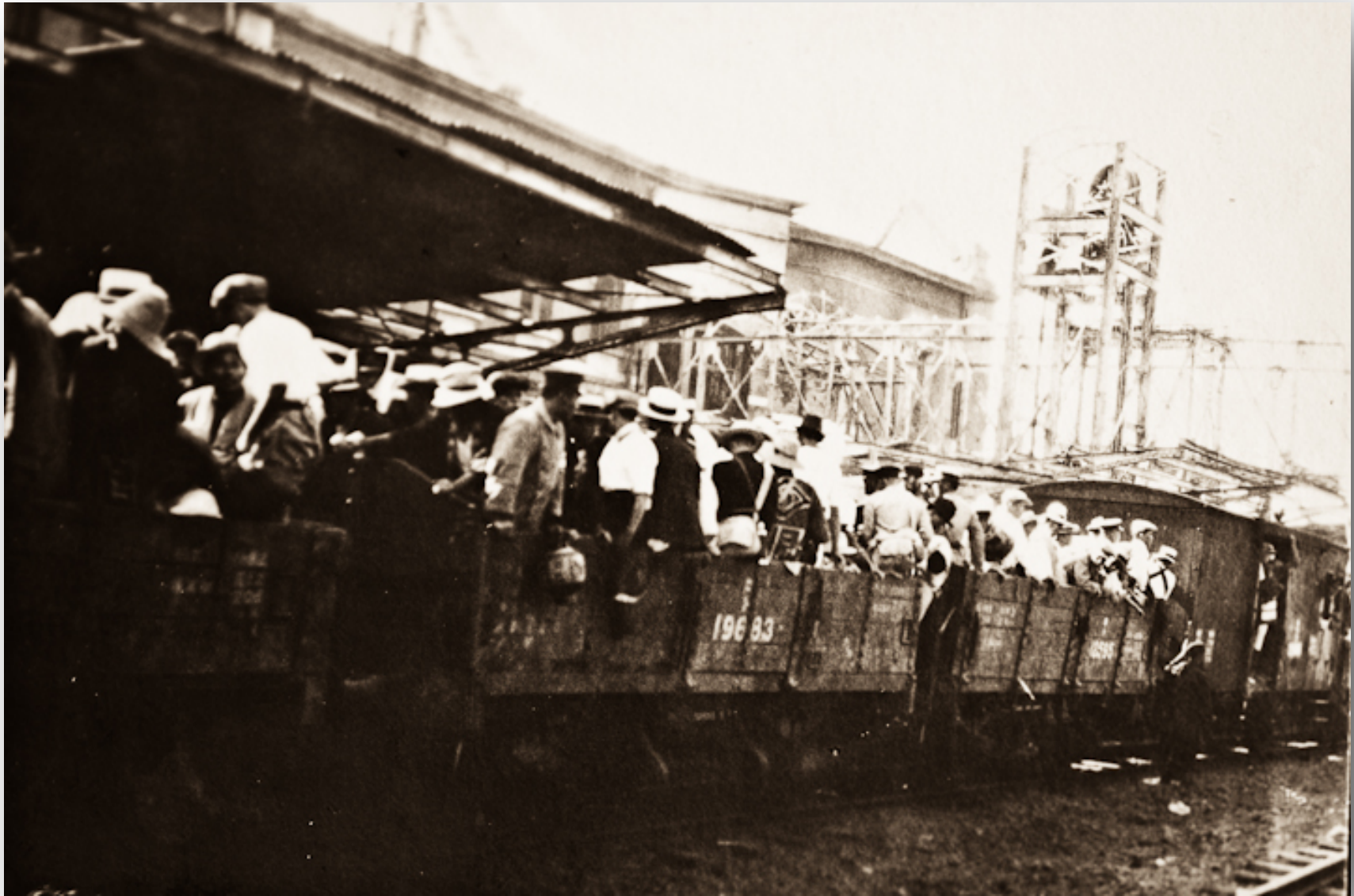
The Great Kanto Earthquake, 1923