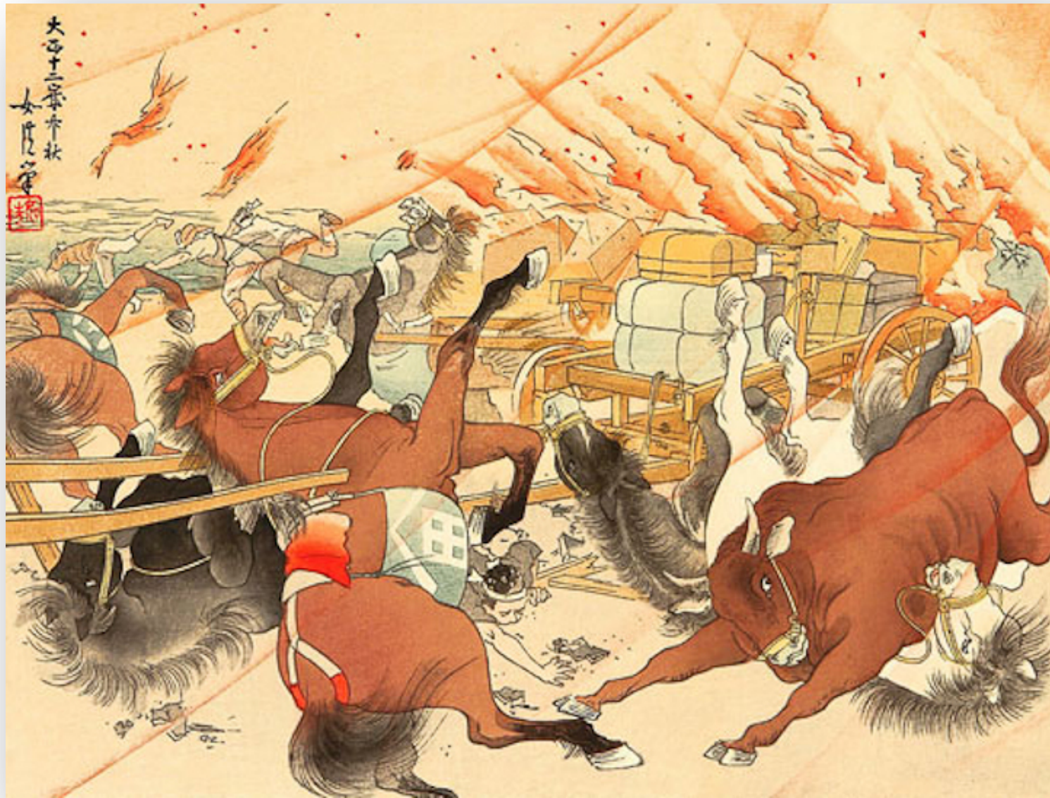
The Great Kanto Earthquake, 1923