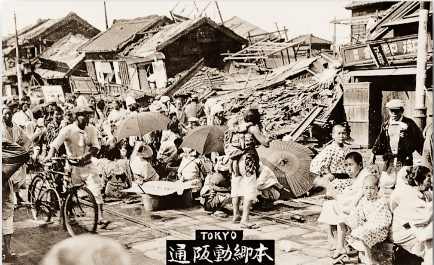
The Great Kanto Earthquake, 1923