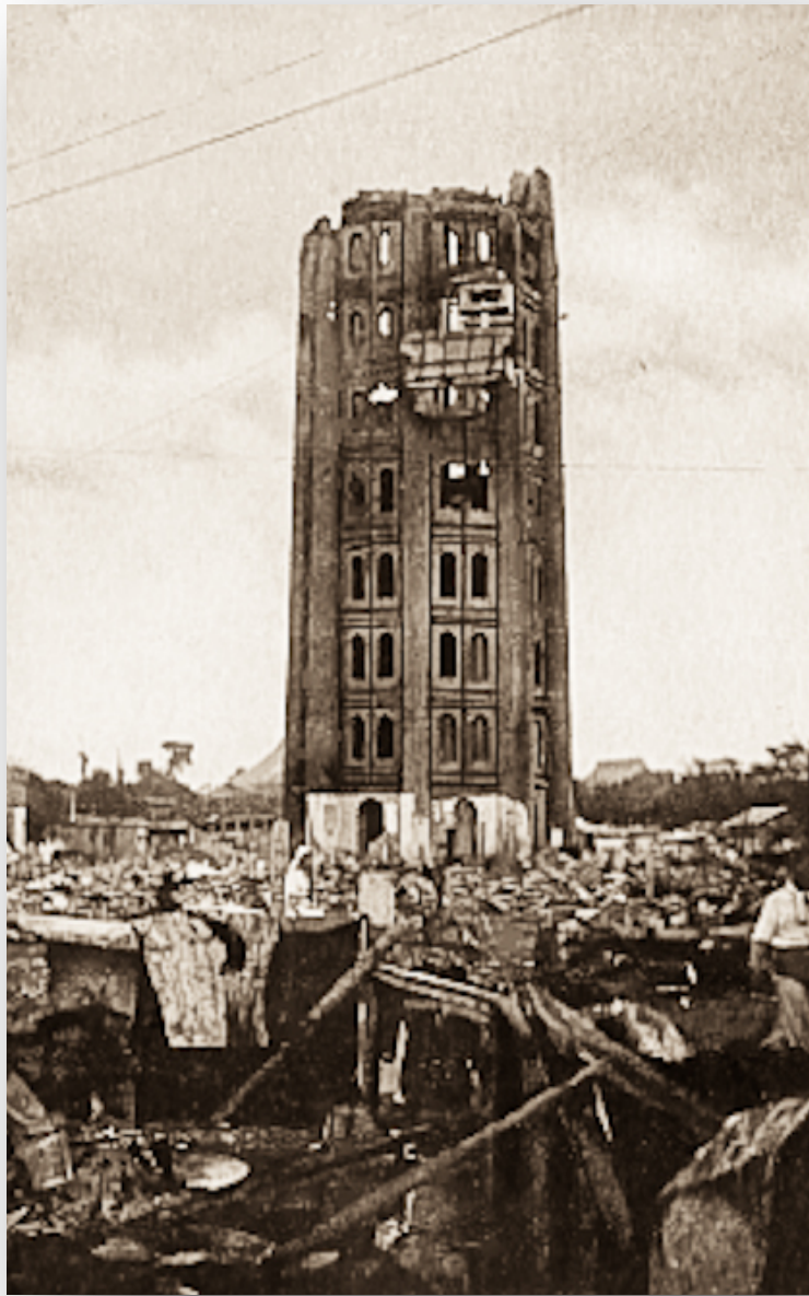
The Great Kanto Earthquake, 1923