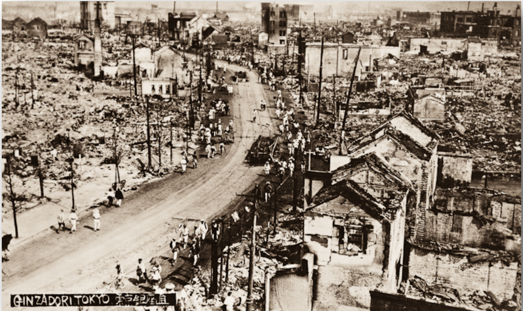
The Great Kanto Earthquake, 1923