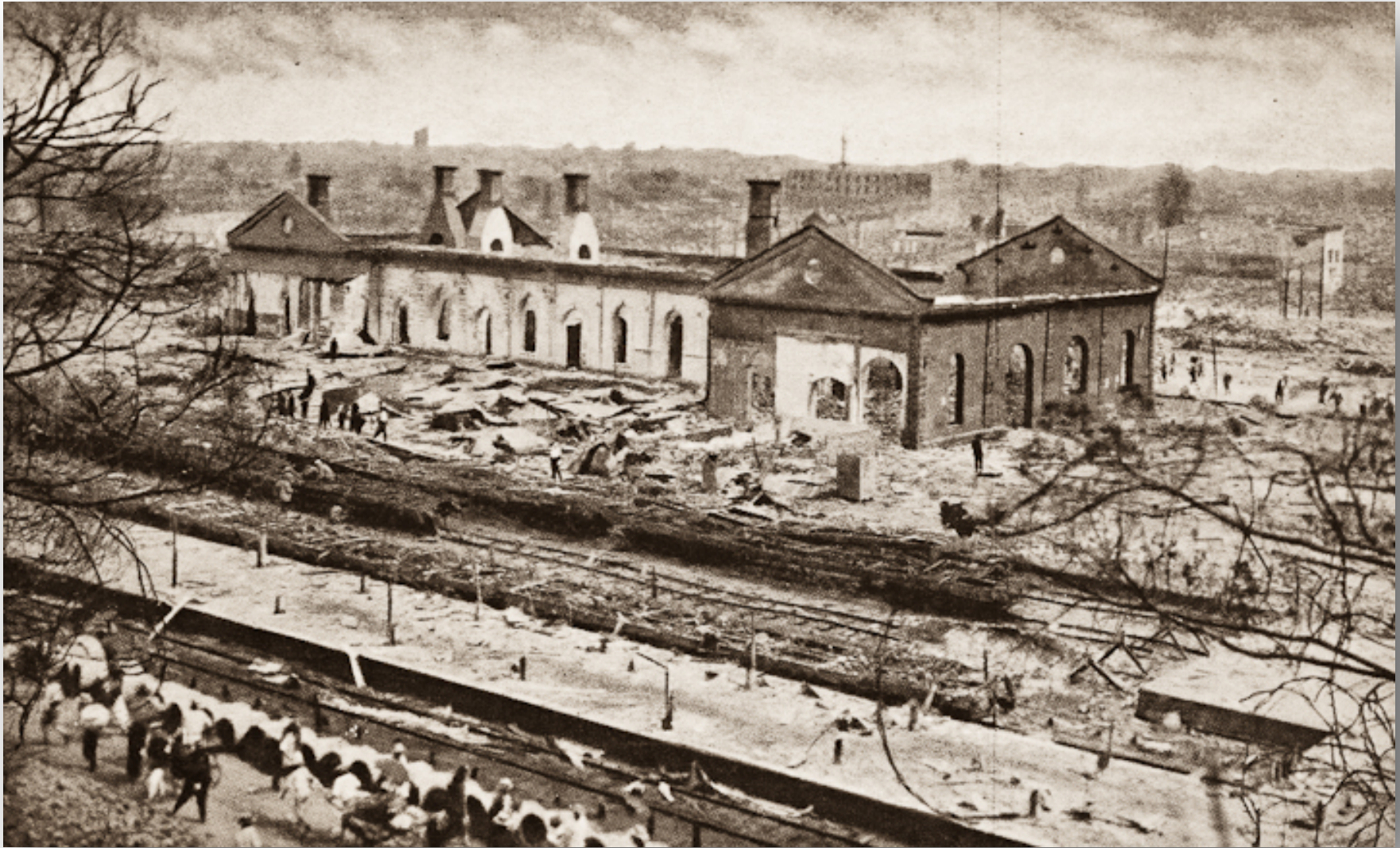
The Great Kantō Earthquake, 1923