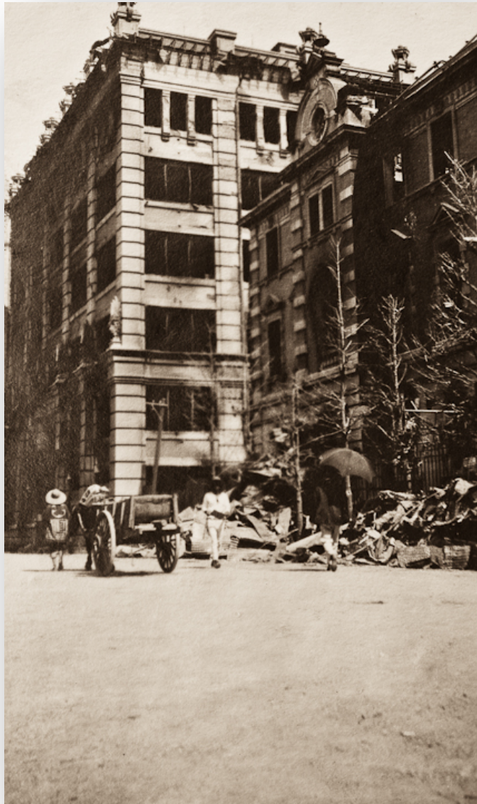
The Great Kanto Earthquake, 1923