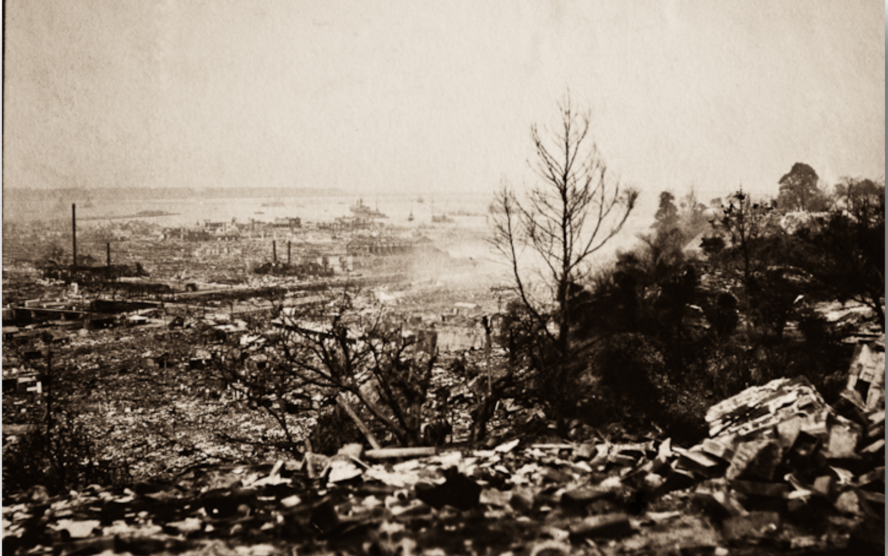
The Great Kantō Earthquake, 1923