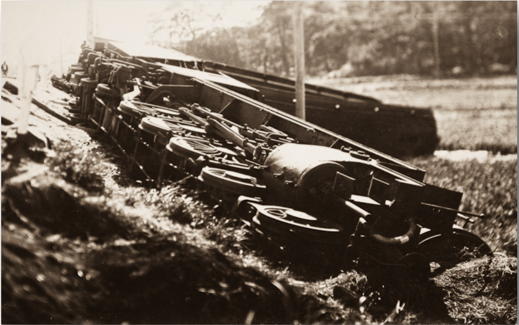
The Great Kanto Earthquake, 1923