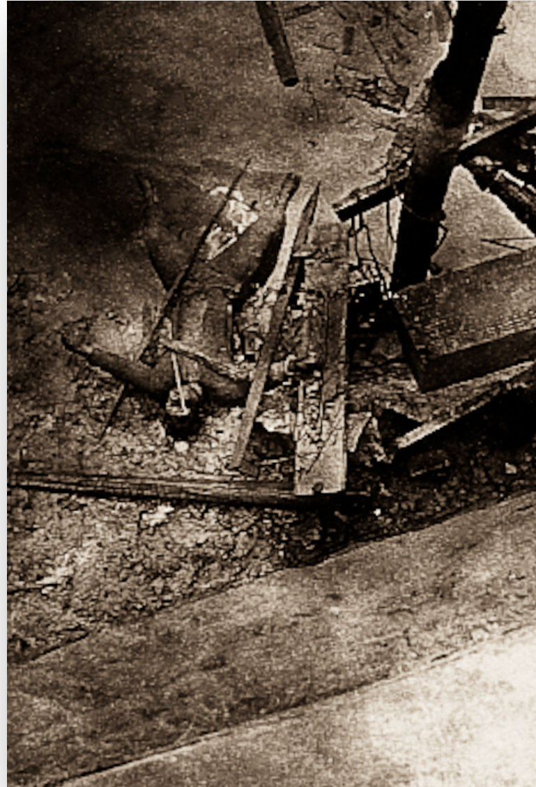
The Great Kantō Earthquake, 1923