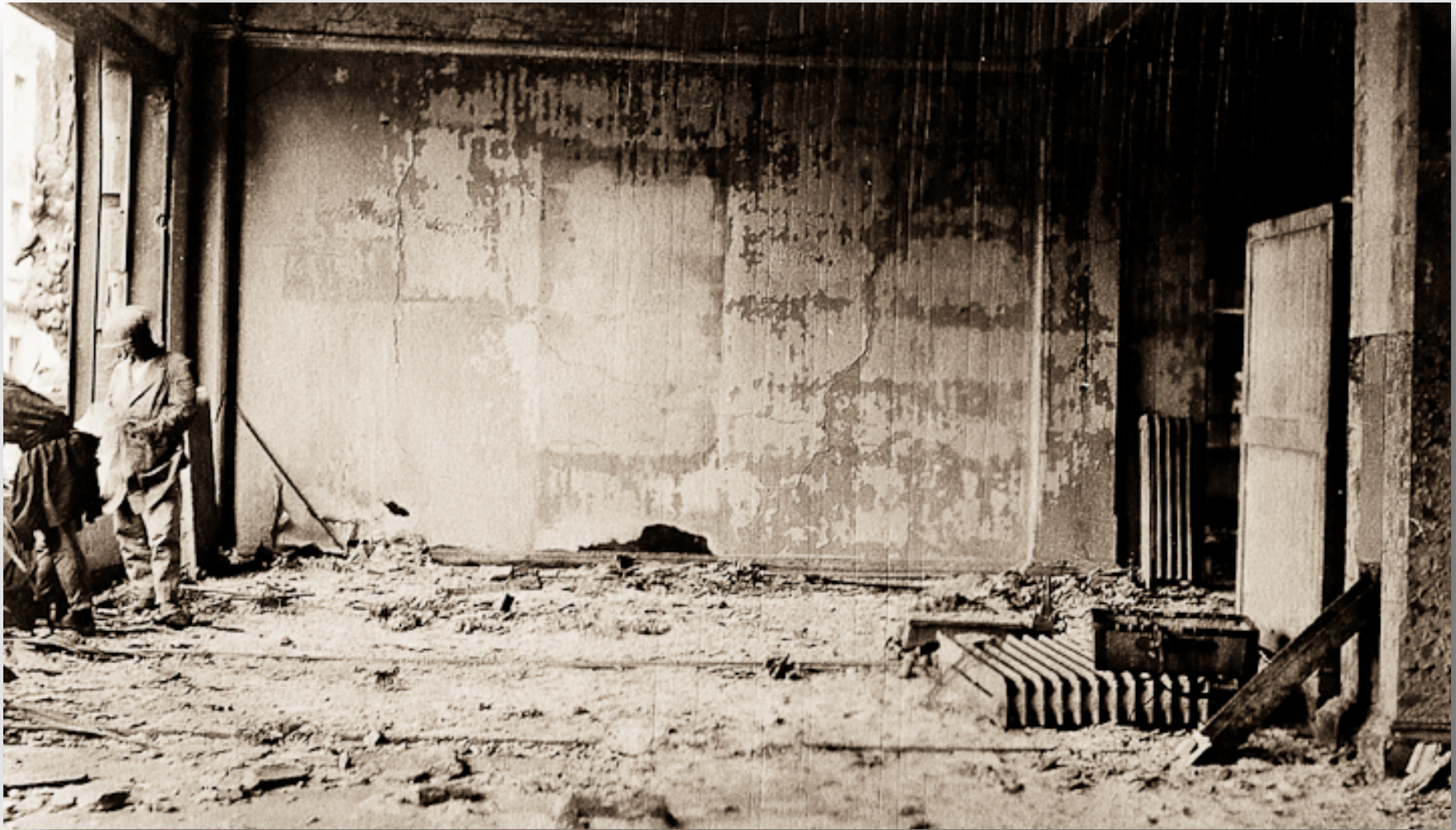
The Great Kantō Earthquake, 1923