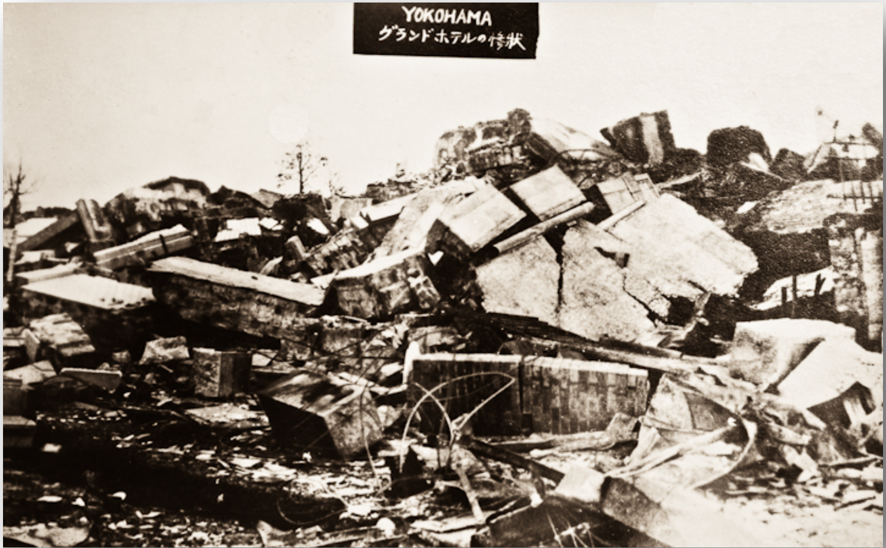
The Great Kantō Earthquake, 1923