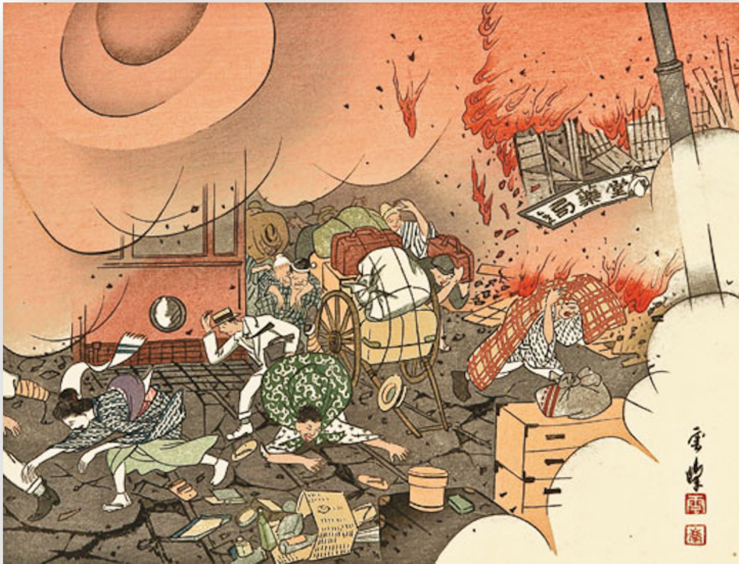
The Great Kanto Earthquake, 1923