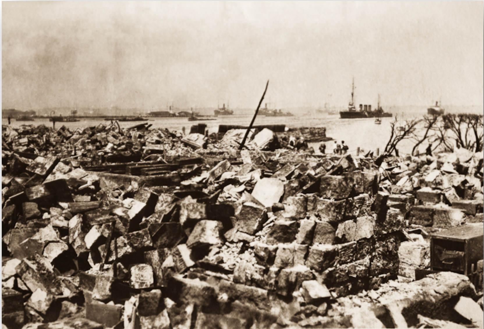
The Great Kantō Earthquake, 1923