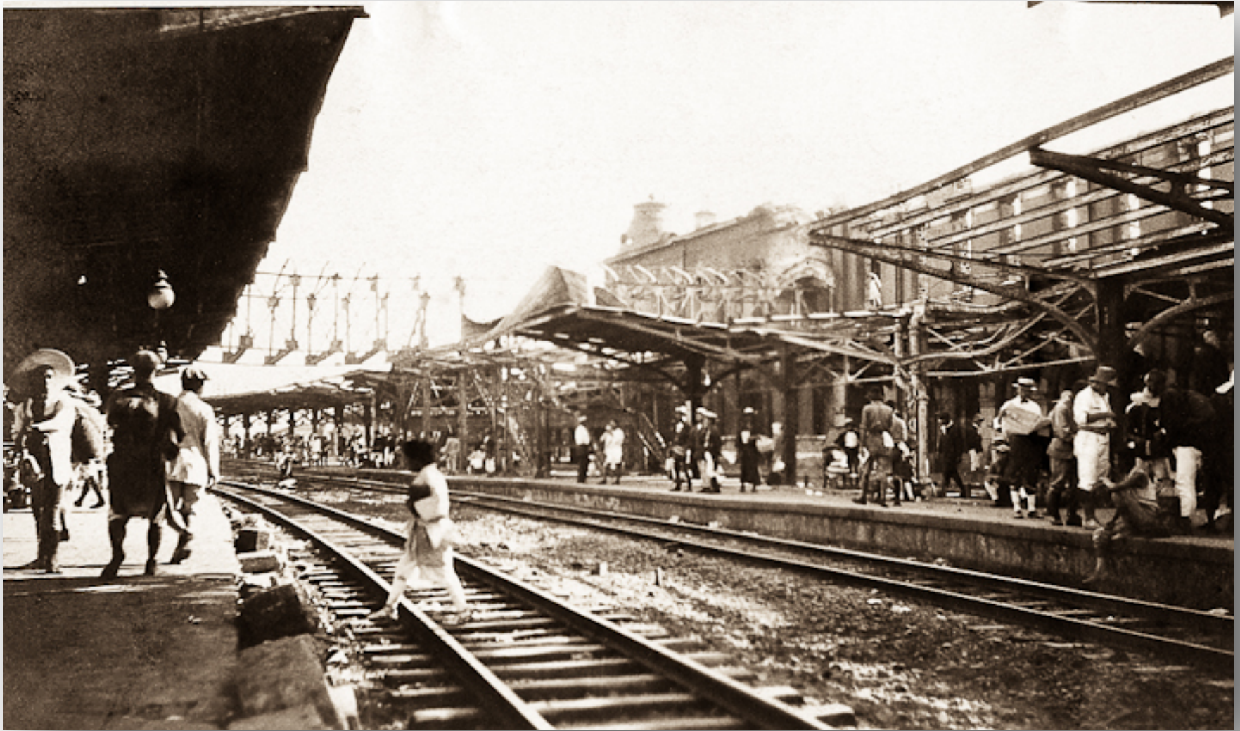
The Great Kantō Earthquake, 1923