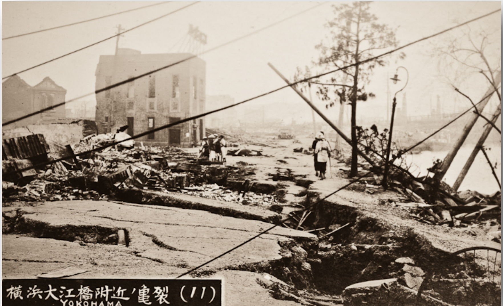
The Great Kantō Earthquake, 1923