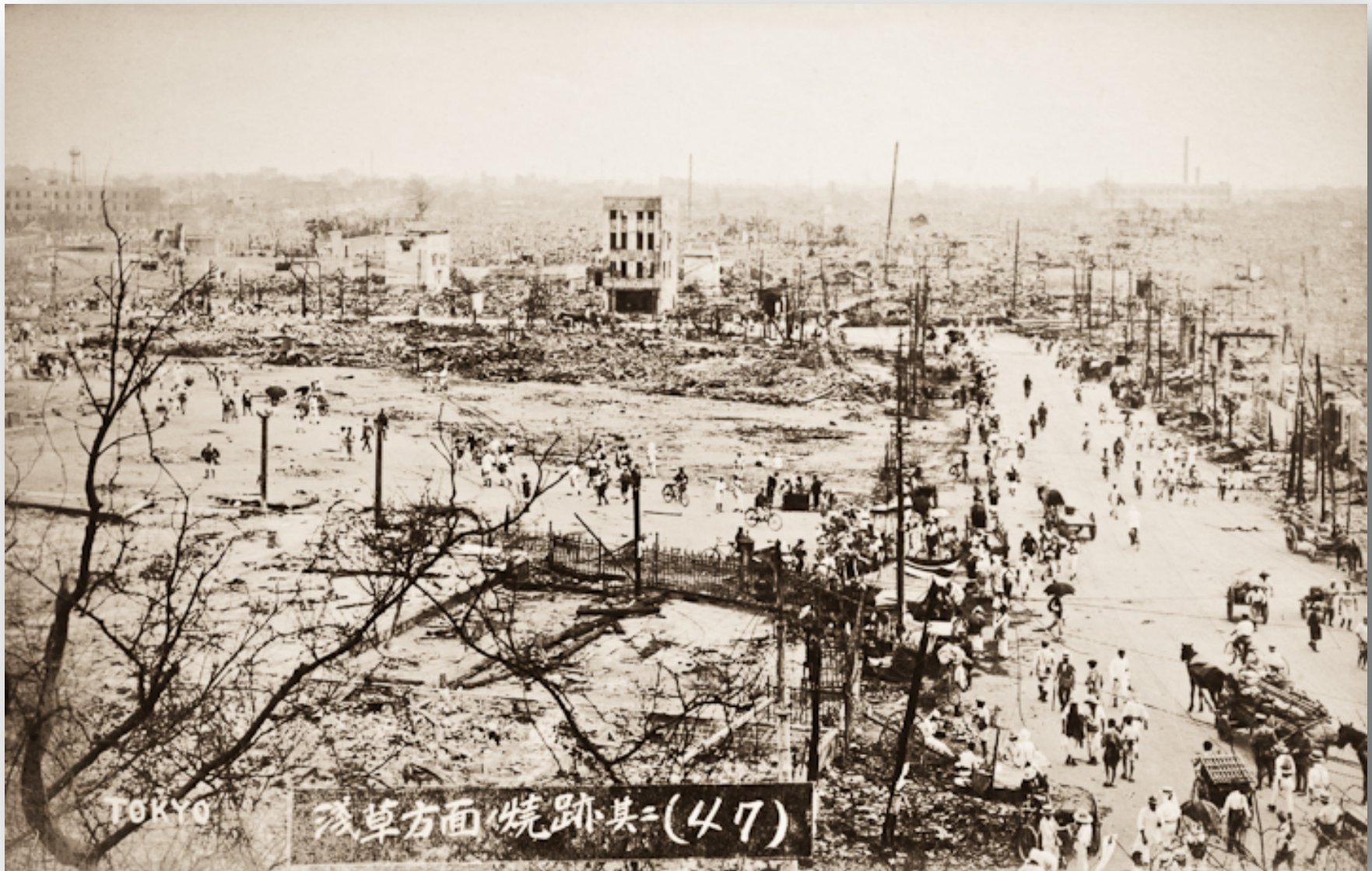
The Great Kantō Earthquake, 1923