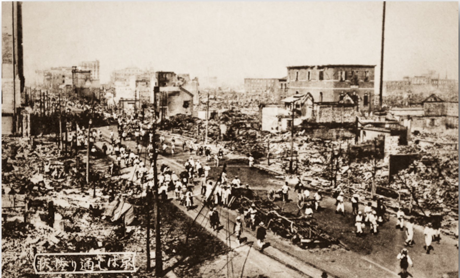
The Great Kanto Earthquake, 1923