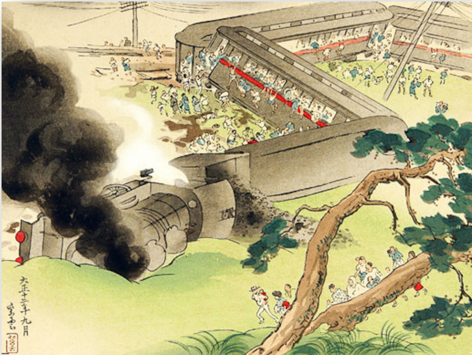
The Great Kanto Earthquake, 1923