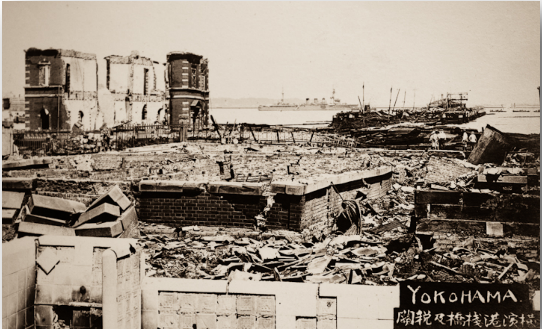
The Great Kanto Earthquake, 1923