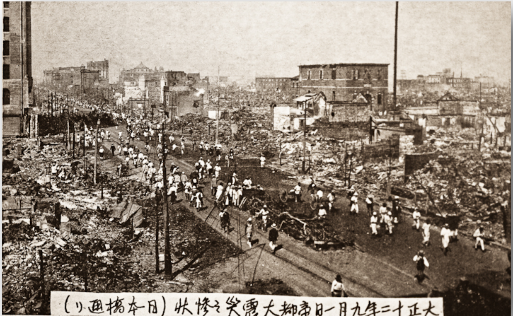
The Great Kantō Earthquake, 1923