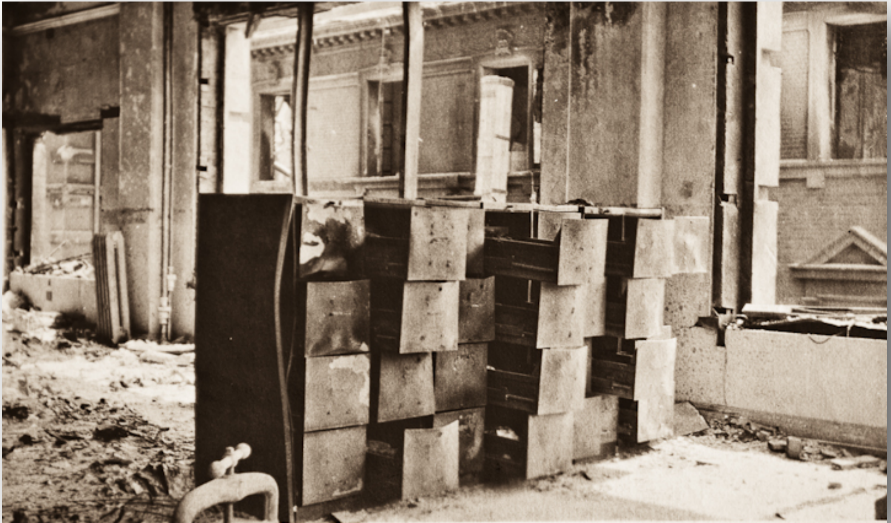
The Great Kantō Earthquake, 1923