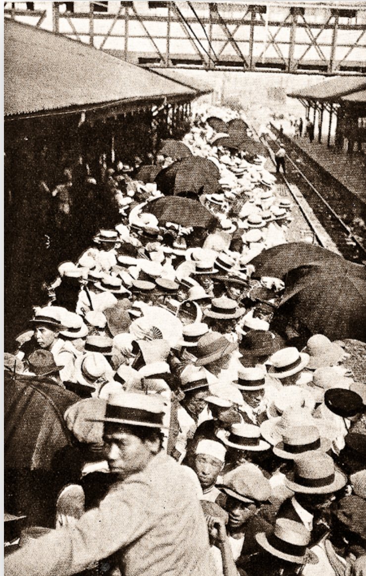
The Great Kanto Earthquake, 1923