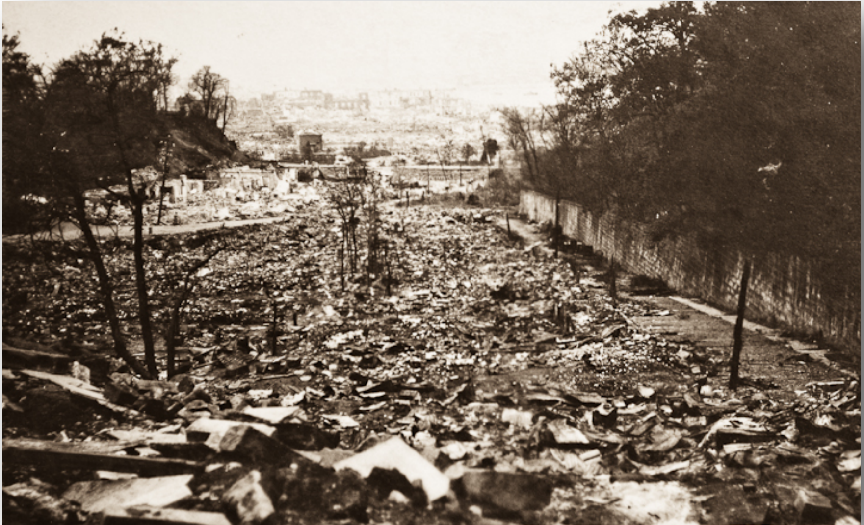
The Great Kanto Earthquake, 1923