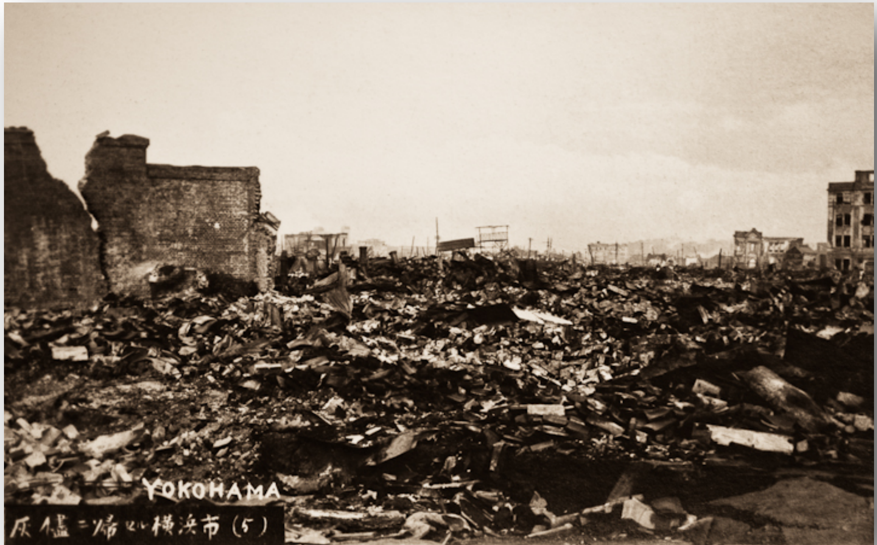
The Great Kantō Earthquake, 1923