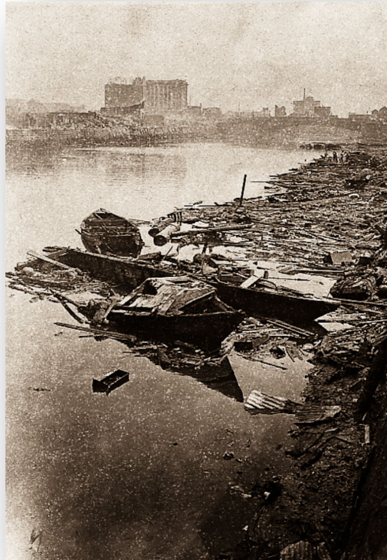
The Great Kantō Earthquake, 1923