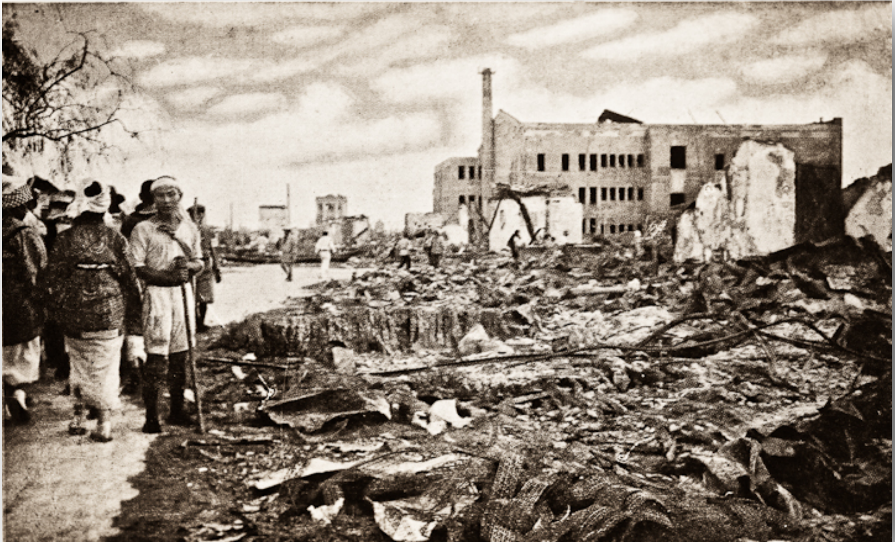
The Great Kanto Earthquake, 1923