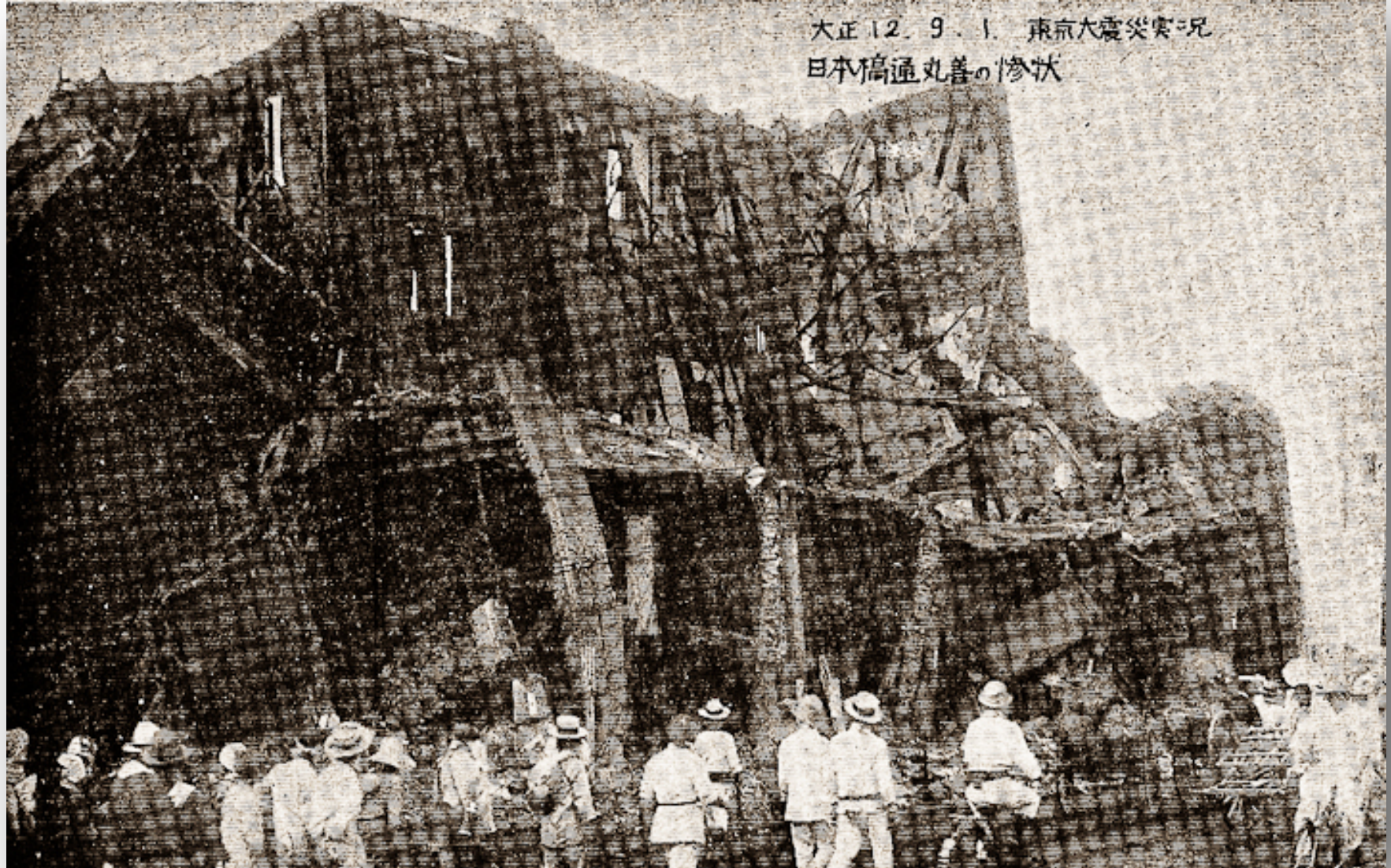
The Great Kantō Earthquake, 1923