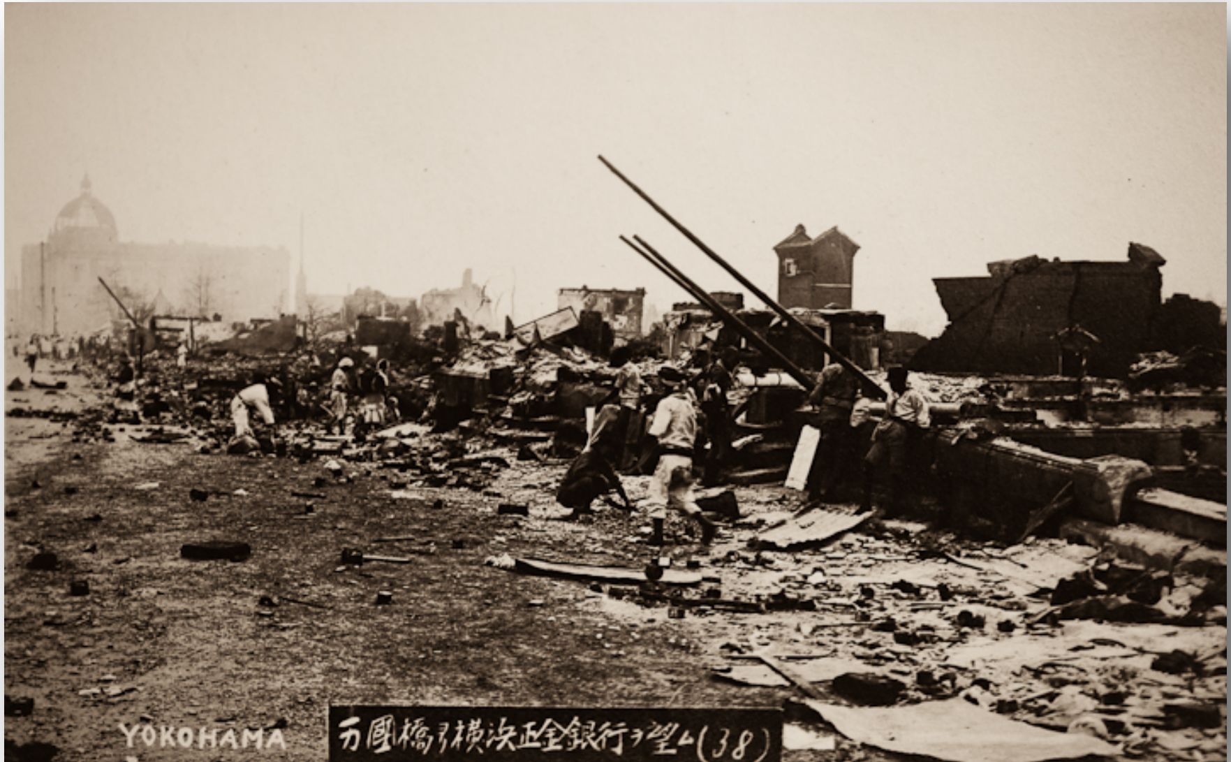
The Great Kanto Earthquake, 1923