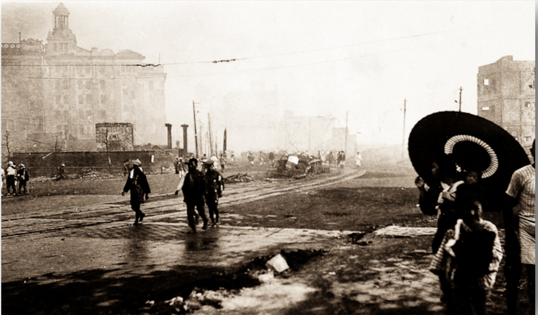
The Great Kantō Earthquake, 1923