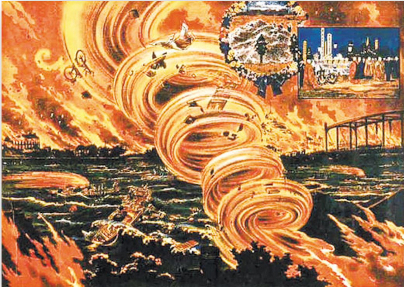
The Great Kantō Earthquake, 1923