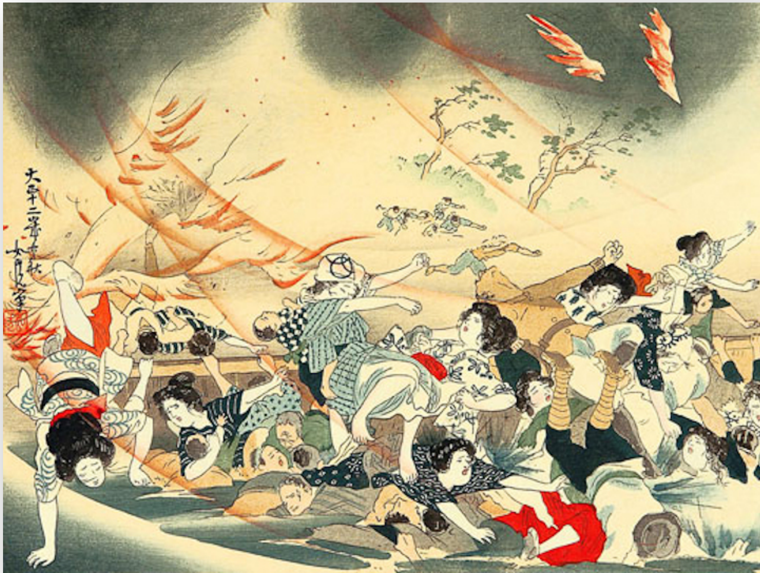
The Great Kanto Earthquake, 1923